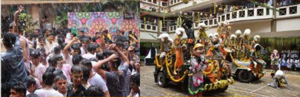
Grand Events & Festivals @ Our Institute