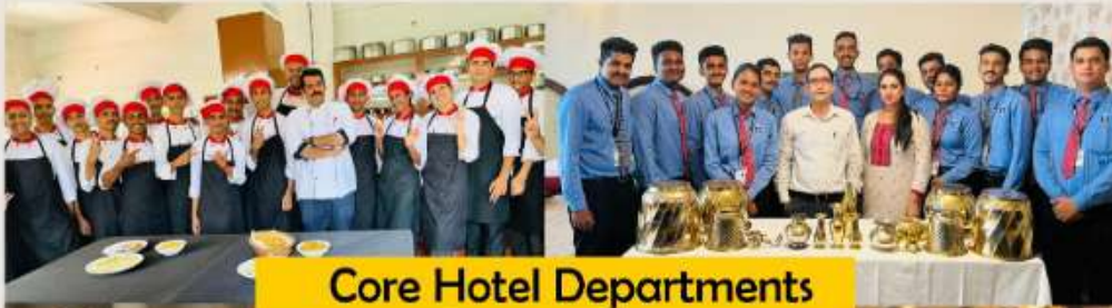
Core Hotel Departments